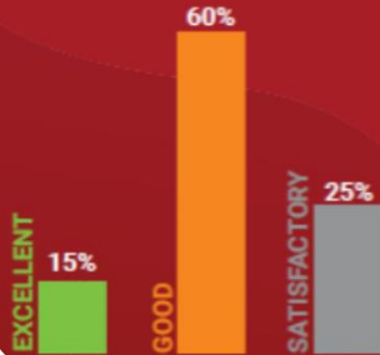
QUANTITY OF VISITORS