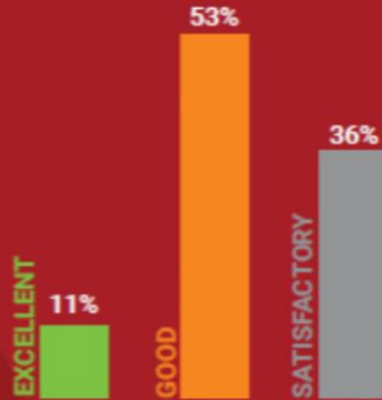
QUALITY OF VISITORS