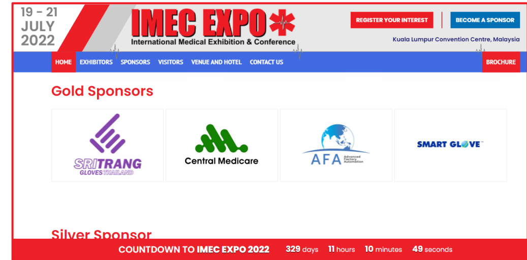
Featured logo with redirecting link to website.