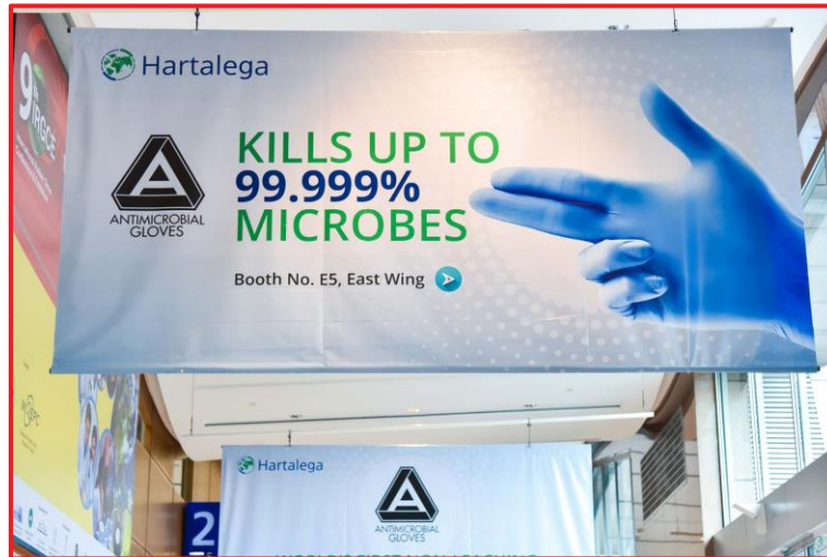
Example of hanging banner in the foyer.