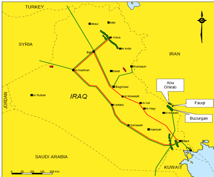
Figure 1: Location Map of Missan Oil Fields

Missan province consist of three oilfields, inclusive of Abu Ghirab, Buzurgan and Fauqi oilfields. Among them, Abu Ghirab and Fauqi oilfields are located across the border between Iraq and Iran. Abu Ghirab oilfield contract area is 30km × 6km, Buzurgan oilfield contract area is 40km × 7km, and Fauqi oilfield contract area is 23km × 6km.